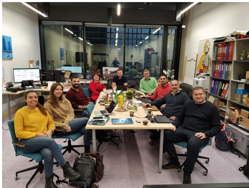
Happy TyB partners in Tartu, Estonia (Nov. 7-8, 2021)

In addition to the first “real” meeting in Estonia, the partners felt the need to meet up virtually in between of the next scheduled transnational meetings, in order to quickly discuss about less urgent but equally important decisions.